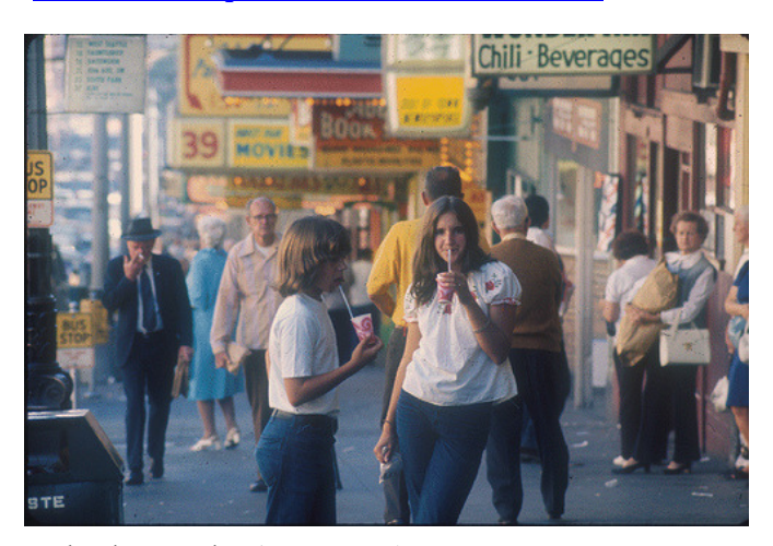
Pedestrians on First Avenue, 1975 Item 35977, Pike Place Market V isual Images and Audiotapes (Record Series 1628-02), Seattle Municipal Archives.

The most popular image on the Seattle Municipal Archives Flickr site for August through November was of First Avenue in 1975: <a href="http://www.flickr.com/photos/">http://www.flickr.com/photos/</a> seattlemunicipalarchives/4948398055/