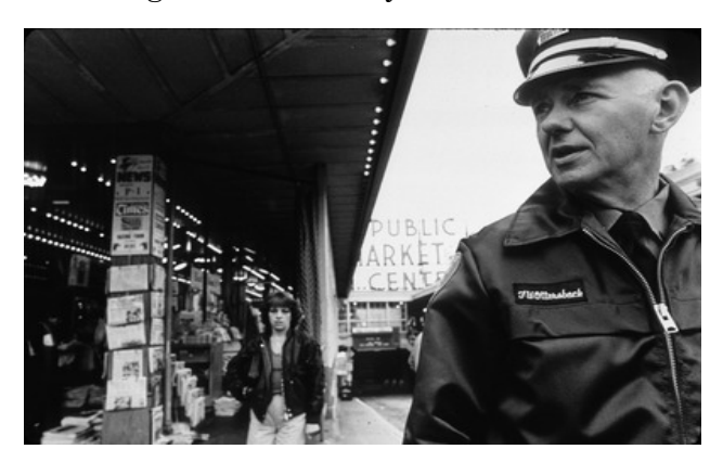
First Avenue Project, November 1981

Flickr commenters continue to provide us with more information about the people and places depicted in our photographs. An image of a swimming instructor with two small boys prompted someone to write that the man had "taught swimming at West Green Lake beach for many years. He was my mother's teacher in the 30s and then taught me in the early 50s."