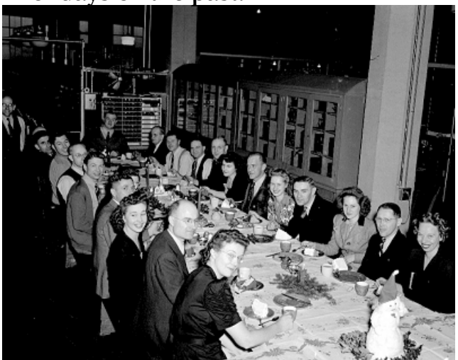
Seattle City Light Meter Division Holiday Party, December 1944 Item 19271, Seattle Municipal Archives