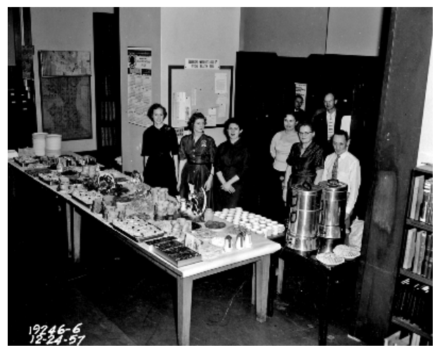
Engineering Department Office Party, December 1957 Item 56407