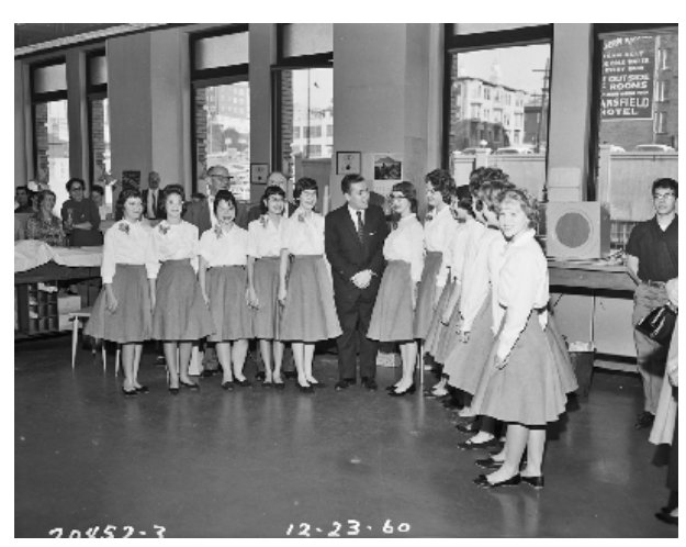
Mayor Clinton with the holiday entertainment, December 1960 Item 66111