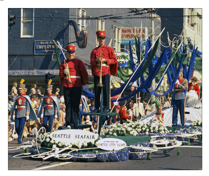
Seattle City Light Seafair Parade Float, August 6, 1964 Crop of Item 75975, Seattle Municipal Archives