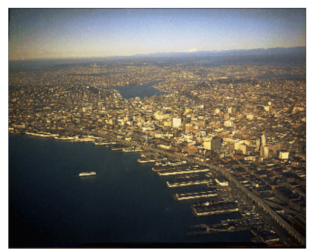
Aerial of Seattle Waterfront, circa 1960 Item 75970