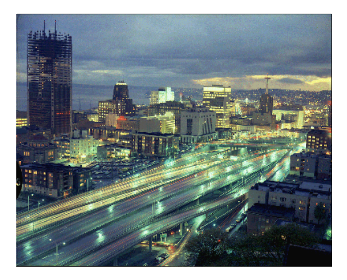
Downtown Skyline and I-5, 1968 Item 75974

These recently cataloged and indexed photographs are from the Seattle City Light Color Negatives, a collection of several thousand color photographs taken from the 1960's to the mid-1990's. The collection includes many City Light facilities, promotions, and general city images used in various publications.