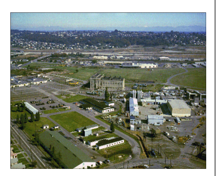
Georgetown Steam Plant, September 1970 Item 75964, Seattle Municipal Archives