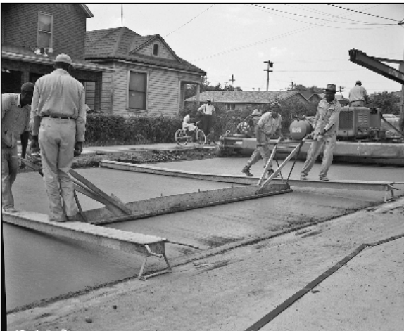
Empire Way Paving, Dearborn Street to King Street. June 26, 1958 Item 57895