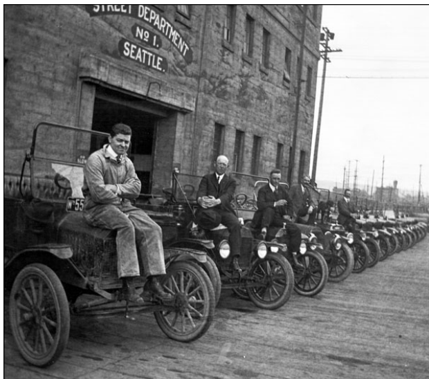
Charles Street Shops and Street Department Vehicles and Personnel, 1912. Originally the Charles Street Stables, the Charles Street Shops complex south of downtown maintains the City's large fleet of vehicles.

Building a network of streets, arterials and bridges, and establishing a public transit system;