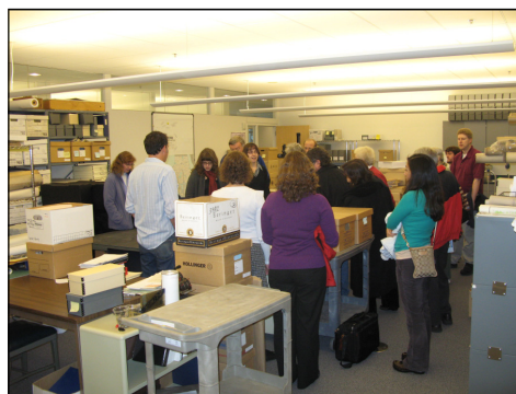
Tour of SMA, October 2009

October was Archives Month, and our state's theme this year was "Washington at Play." SMA held an open house on October 29, welcoming both veteran users and some who had never before been to the archives. Exhibits were on display, and archivists were available to answer questions about SMA holdings and provide research assistance. Several tours were also provided, allowing visitors a behind-the-scenes look at work areas and the storage vault, as well as a look at a few highlights from the collection.