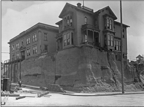
Ross Shire Hotel, 6th Avenue & Marion Street, 1914. One of several privately owned "pinnacles" in regraded areas where private land-owners did not arrange to have their property lowered at the same time the City paid to have the adjoining street regraded.

The exhibit begins by illustrating Seattle's growth as a city—from its geographic transformation through a series of regrades, landfills, and manmade waterways; to its structural development as the Northwest's largest city; to its attitudinal development, whether by celebrating the city's achievements or confronting its challenges—human or natural.