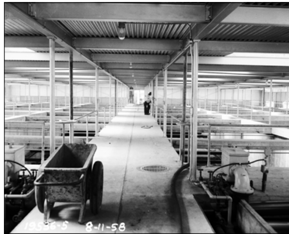
Interior of Alki Treatment Plant, August 11, 1958 Item 58038