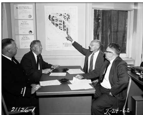
Urban renewal planning meeting, 1962 Item 72250, Seattle Municipal Archives

http://www.flickr.com/photos/seattlemunicipalarchives/