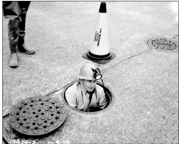
Walk through sewer, 30th Ave. N. and E Thomas St., November 3, 1958