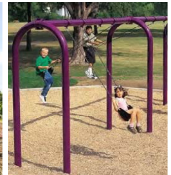
SWINGS 5" POSTS LANDSCAPE STRUCTURES 2-12