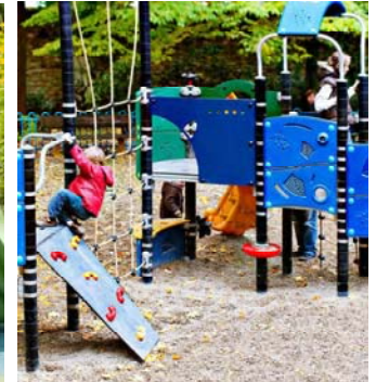
ELEMENTS KOMPAN 2-5