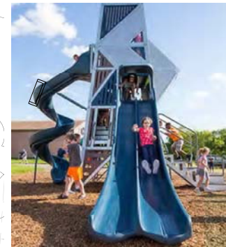
ALPHA TOWER LANDSCAPE STRUCTURES 5-12