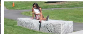
SLAB - GRANITE SLAB