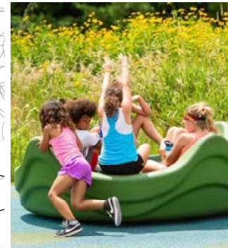
OMNISPINNER LANDSCAPE STRUCTURES 2-5