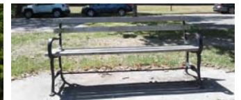
SEAT - OLMSTED BENCH