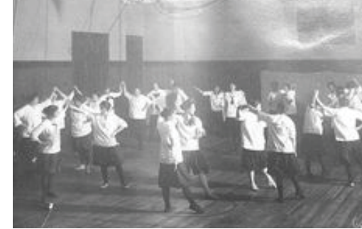
Dance class at Hiawatha Playfield circa 1915