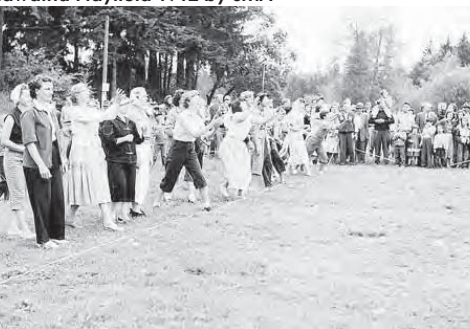
Hiawatha Playfield 1912