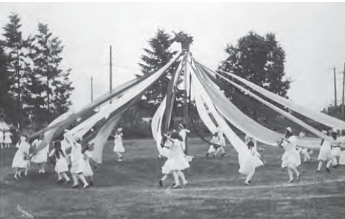
May fete at Hiawatha Playfield 1914