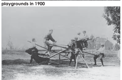
Children at Hiawatha Playfield 1912