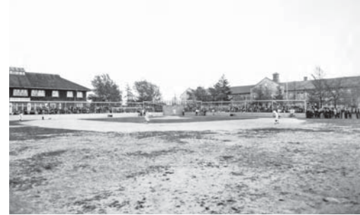
Baseball game at Hiawatha Playfield 1915 by SMA