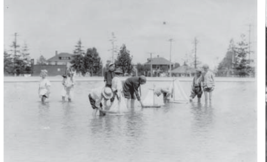
Hiawatha Playfield wading pool 1912 by SMA