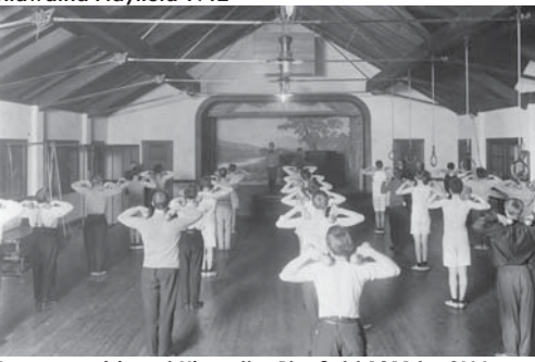
Boys exercising at Hiawatha Playfield 1911 by SMA