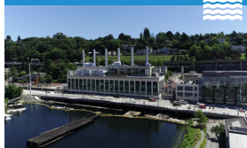
Lander St Bridge