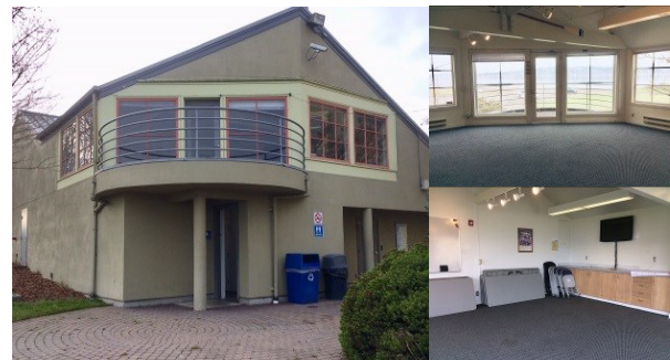
Small Meeting Room $49.00/hr. (Seats 20 people)

Tours Tuesdays 5:00 PM to 6:00 PM Thursdays 3:00 PM to 5:00 PM (Check website for any canceled dates)