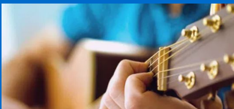
Photo link: Article: Does music affect your mood?